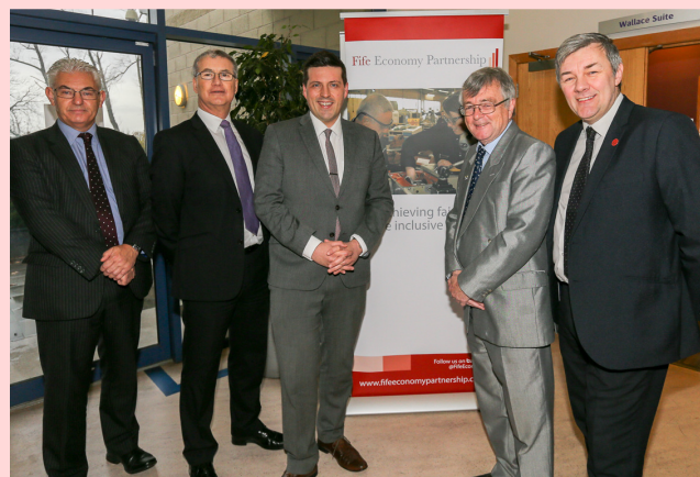
Members of the Fife Economy Partnership meet Jamie Hepburn MSP, Minister for Business, Fair Work and Skills

Its roles, which are overseen by the Executive Group, include setting the priorities for growing Fife's economy, overseeing the implementation of Fife's Economic Strategy 2017-2027 , ensuring the public sector's policies and activities support the growth of the Fife economy, and presenting Fife's case to the Scottish Government and Scottish Enterprise.